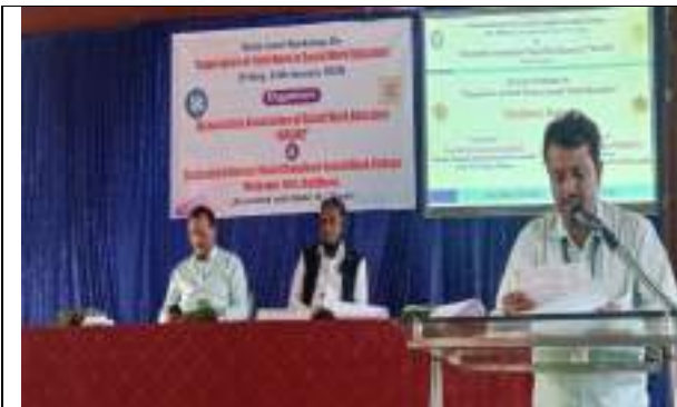
F.W. Seminar Participation