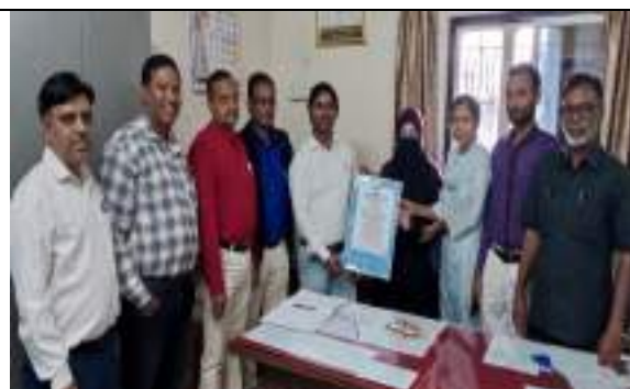
Indian Constitution Preamble Gift to NGO