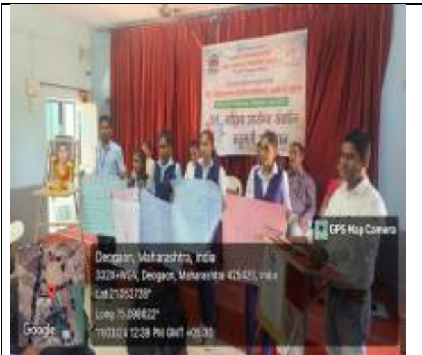
Field work Presentation