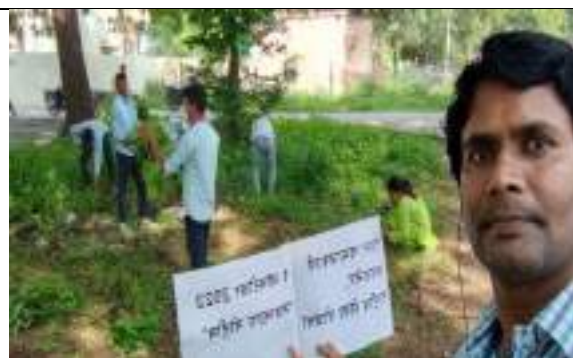
Field Work Cleanness Programme