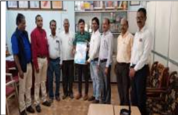
26th NOV day Celebration