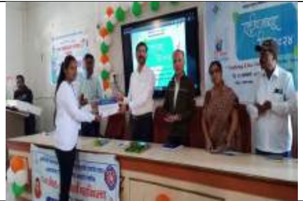
F. W. Activity Facilitation