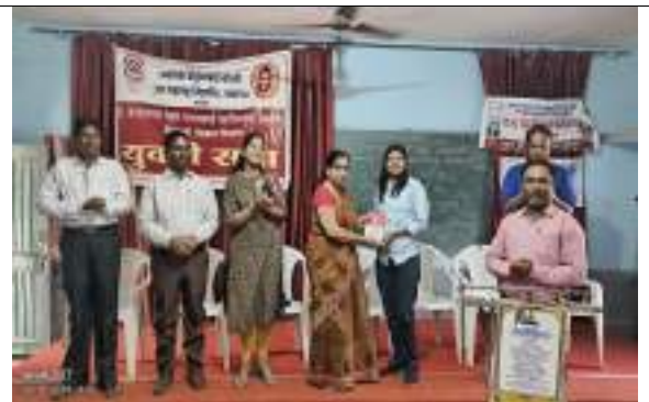
Voter ID programme Awareness