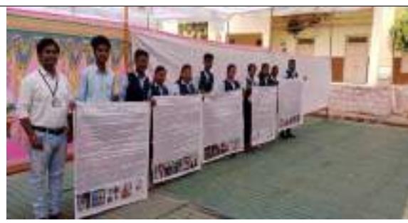
Avishkar 2023 Paper presentation