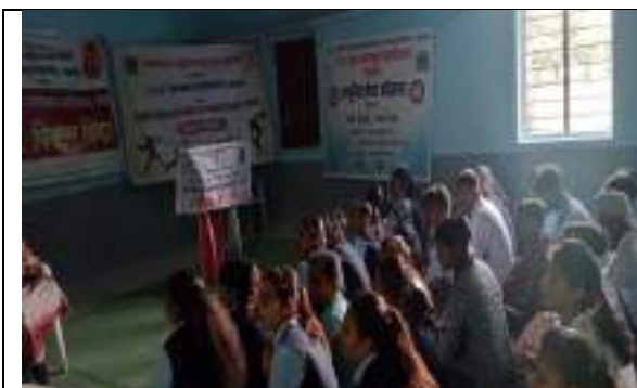
Field work Classroom Orientation